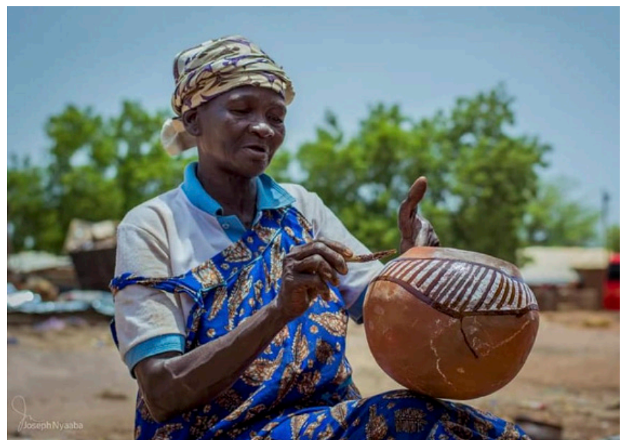
A potter making impressive designs on her earthen pot. Bolgatanga Craft