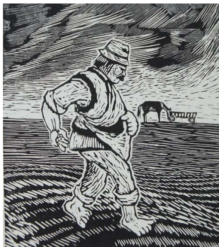
Above: barefoot farmer sowing seeds in a wheat field

if Jesus himself be our leader we shall walk through the valley in peace