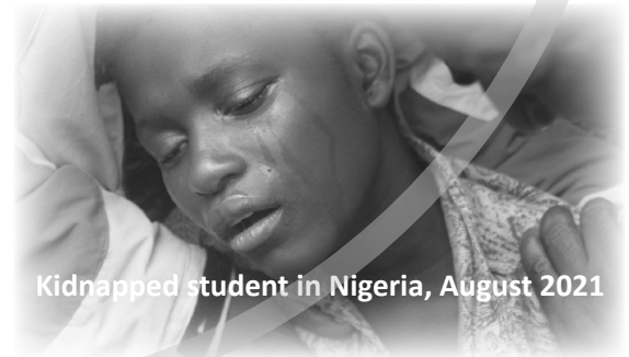
Kidnapped student in Nigeria, August 2021