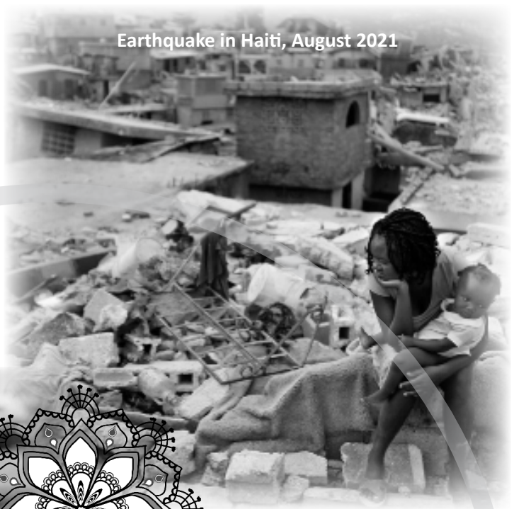
Earthquake in Haiti, August 2021