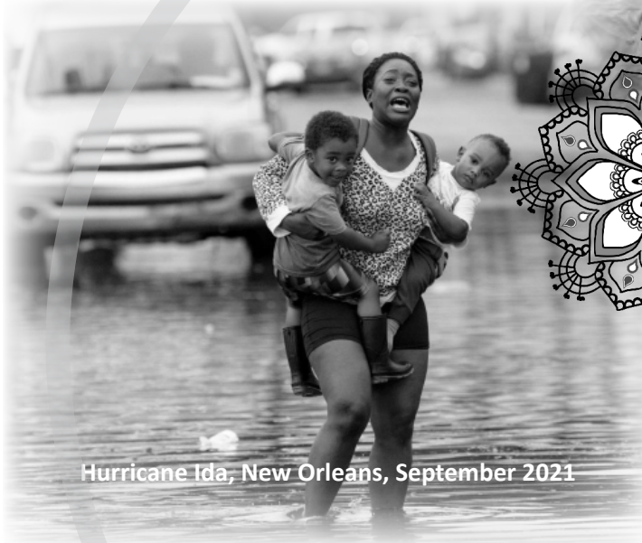
Hurricane Ida, New Orleans, September 2021