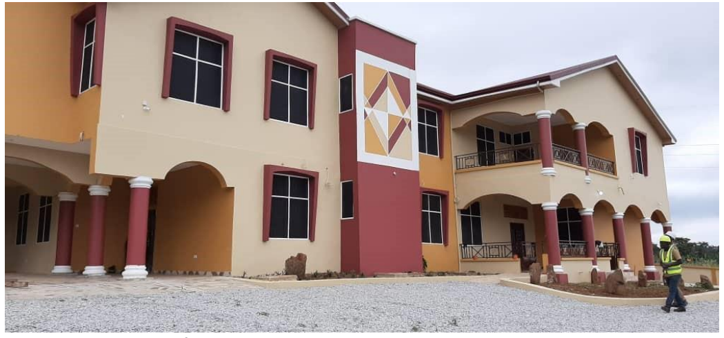
In 2019, the Society of the Holy Child Jesus built a new school and convent in Goaso, Ghana.

As we look to the future of Love & Serve , the Society's priorities include supporting lifelong formation; enabling sustainable growth of ministries in the Province; undertaking capital projects to build, expand or improve schools; and providing accommodation for Sisters, including retirement facilities.