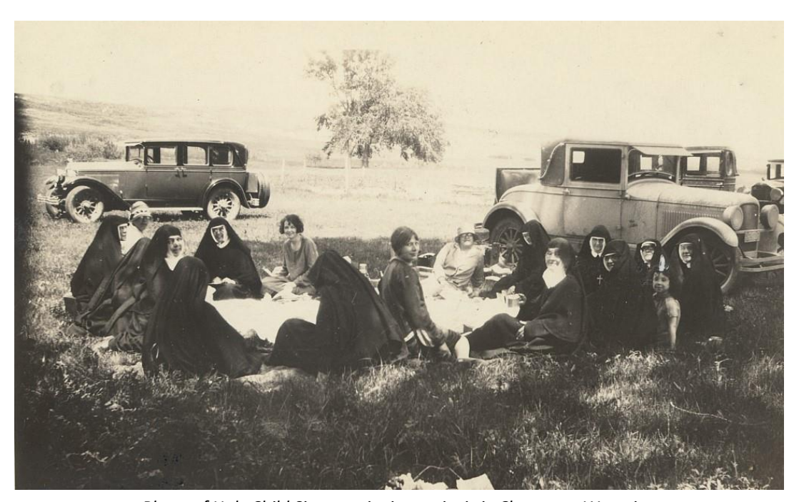
Photo of Holy Child Sisters enjoying a picnic in Cheyenne, Wyoming.

Early struggles and challenges proved to be indicative of what lay ahead. Yet, with determination, the Sisters pushed forward, and many of the laity found their spirit to be infectious. By 1879, 55 women had entered the Society.