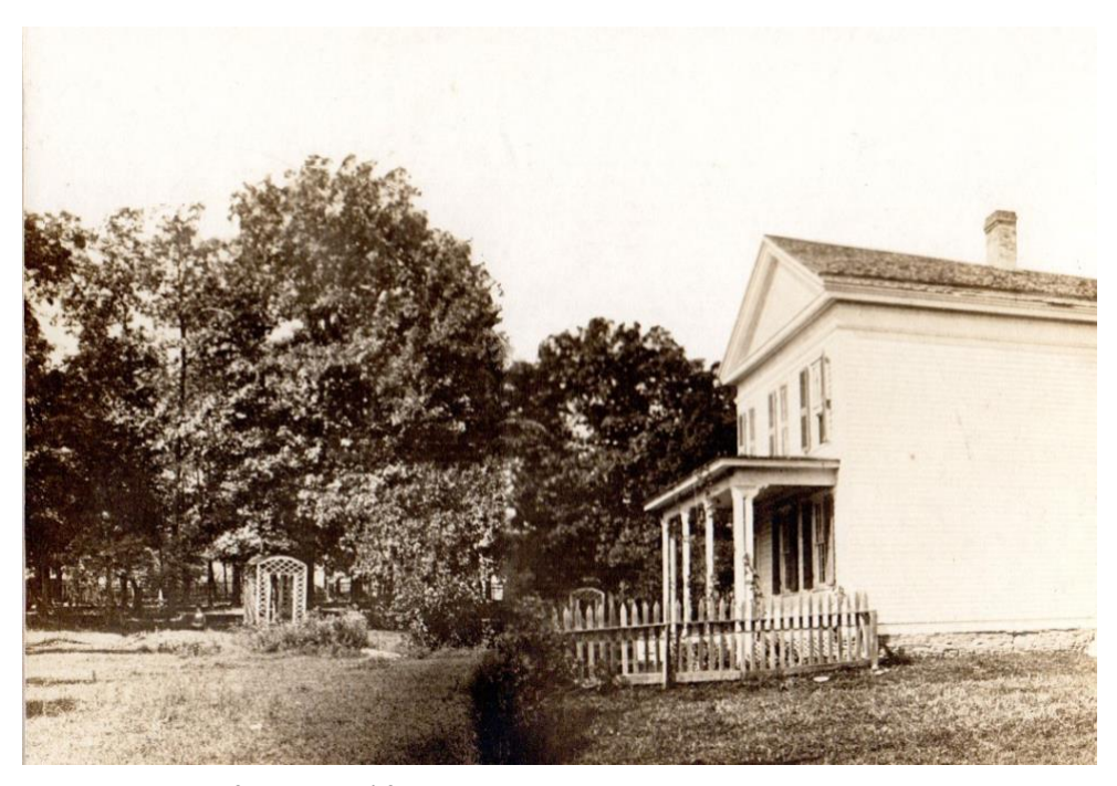
Photo of the Sisters' first convent and school in Towanda, Pennsylvania.

Early struggles and challenges proved to be indicative of what lay ahead. Yet, with determination, the Sisters pushed forward, and many of the laity found their spirit to be infectious. By 1879, 55 women had entered the Society.