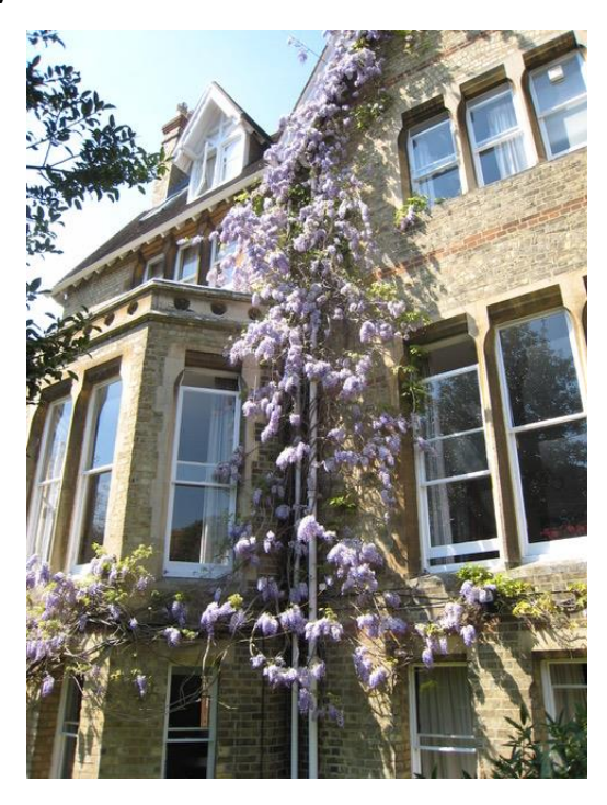
Today, the European Province centre is located at Cherwell Centre in Oxford, England.

Today – as we celebrate 175 years since our founding – we are a much older group of women than the Sisters were during Cornelia's time, but the invitation that has shaped our lives remains undiminished. Whoever we meet, whatever we do, our desire is to help others grow strong in faith and live fully human lives.