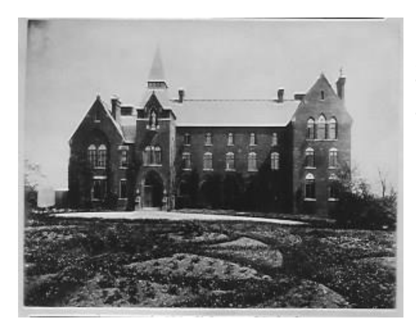
Layton Hill in Blackpool, England, the only school and convent that Cornelia was actually involved in designing and building from scratch.

During Cornelia's lifetime, convents were established up and down England, and Sisters were sent to establish new works in France and the United States. Cornelia wanted her congregation to reflect the love and mercy of God, as they responded to whatever pressing needs they encountered. From the beginning, the Sisters were concerned for women and girls. Wherever they went, the Sisters opened schools, worked in parishes, taught factory girls in night schools, and educated women to be teachers.