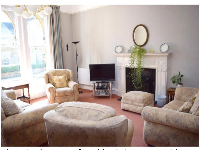
There is also a comfortable sitting room with T.V., a library and beautiful garden.

A kitchen is available for breakfast and for making tea/coffee throughout the day.