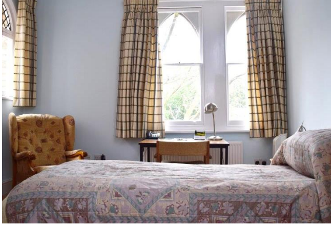
The house has six en-suite bedrooms for individuals wanting to stay overnight.