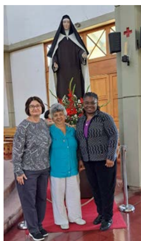
International Associates Conference