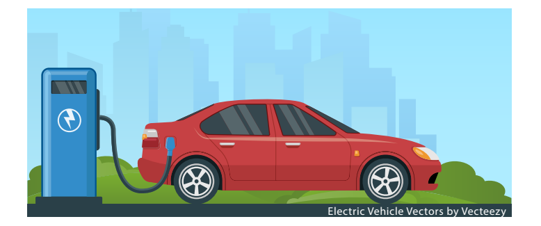
1 Johnson, S. (2021, April 2). How 'green' are electric cars ? Renewable Energy World. <u>https://www.renewableenergyworld.</u> <u>com/blog/how-green-are-electric-cars</u>

See Energy Sage's guide to electric car credits to see if your state has EV incentives. https://electricvehicles.energysage.com