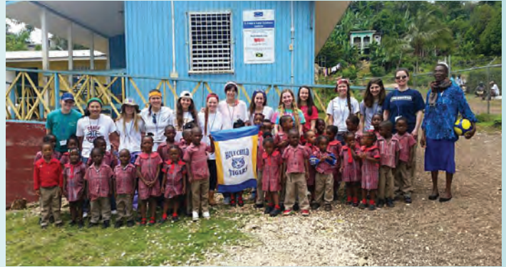
Above: Students, teachers and alums from Connelly School of the Holy Child (Potomac, MD) spend their Spring break participating in a service project with Food for the Poor in Jamaica

The Society of the Holy Child Jesus thanks the Holy Child School community for promoting peace and justice, and protecting God's creation. Through their Actions Not Words , the Holy Child Network of Schools recognizes and embraces the connectedness and interdependence of all people across boundaries.