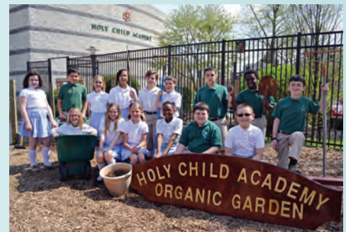
Above: Holy Child Academy (Drexel Hill, PA) establishes an organic garden for their community