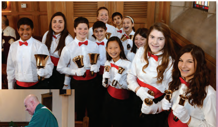
The Holy Child Academy Handbell Choir performed during the Mass