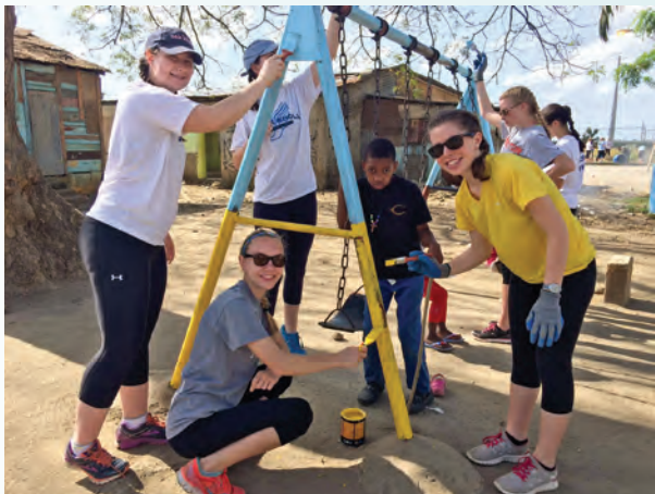
Above: Students and faculty from Oak Knoll School of the Holy Child (Summit, NJ) spend their Spring break volunteering at the Society's mission site in the Dominican Republic