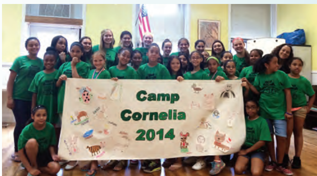
Holy Child high school students volunteer at Cornelia Connelly Center's Camp Cornelia in the City, New York City

The Society of the Holy Child Jesus thanks the Holy Child School community for promoting peace and justice, and protecting God's creation. Through their Actions Not Words , the Holy Child Network of Schools recognizes and embraces the connectedness and interdependence of all people across boundaries.