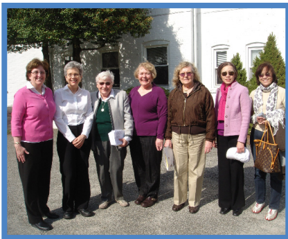
Sharing Our Stories at Rye (April)