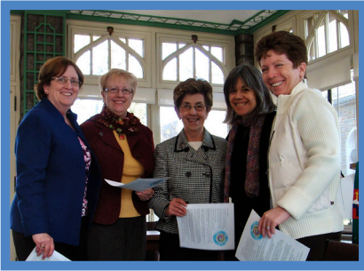
Sharing Our Stories at Rosemont (March)