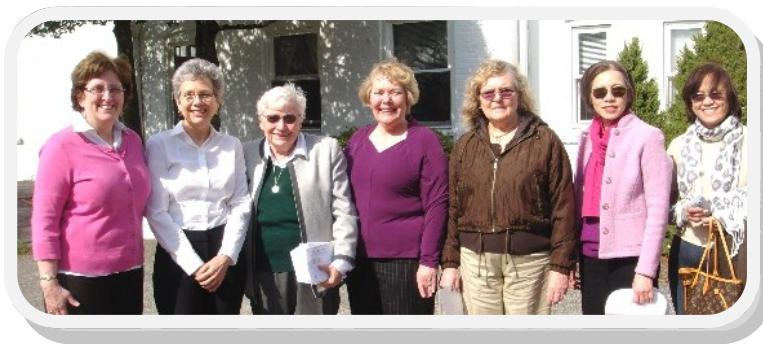
Regional Gathering in Rye—Sharing our Stories

Sharing Our Stories was the theme for our regional gatherings and newsletters this year. Regional gatherings are being held from March through August. The chapter resources on the Incarnation have been the basis for reflection and sharing.