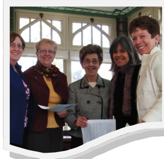
Sharing our Stories, Rosemont